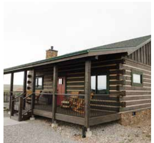
▲ Four newly built rustic log cabins, centrally located and just steps away.

Our four modern log cabins each accommodate up to four guests, making them ideal for wedding parties, family, or out-of-town friends who want to stay close. The main lodge offers six inviting rooms with shared gathering spaces that feel warm and welcoming. Getting ready happens on-site. Morning coffee is shared on the porch. The pace of the day feels easier when no one has to rush off. It's a simple way to make the entire experience feel more connected and personal.